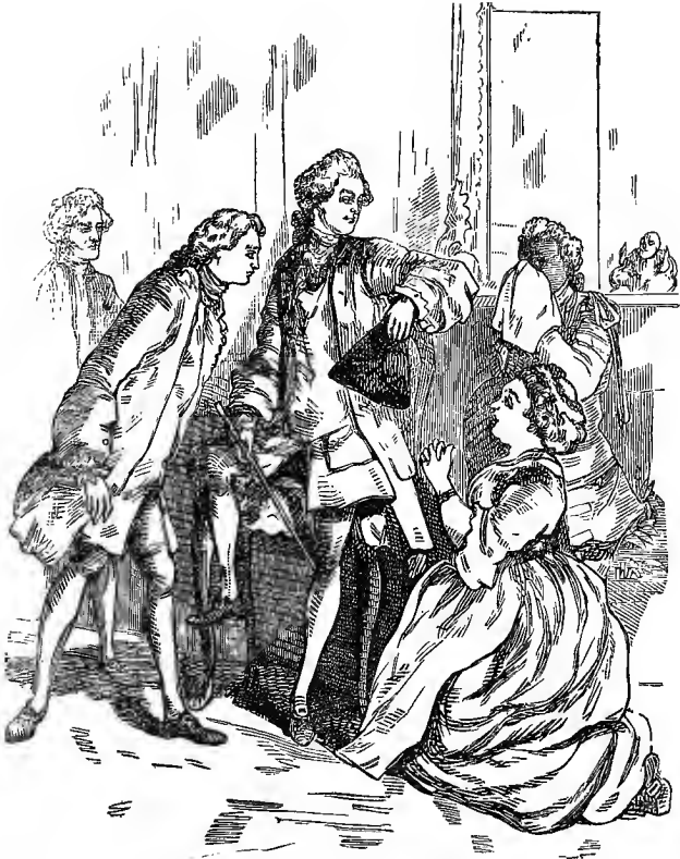
Bad News from Tunbridge.